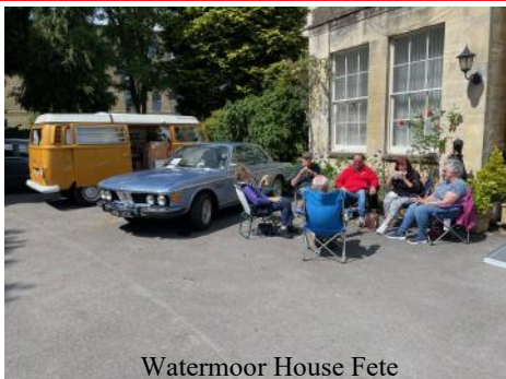
Watermoor House Fete