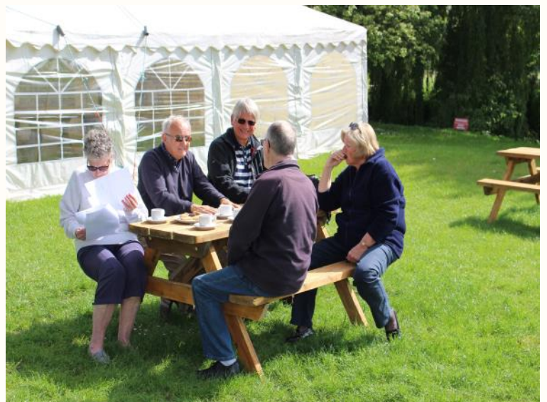
Some Happy participants - noshing away as usual