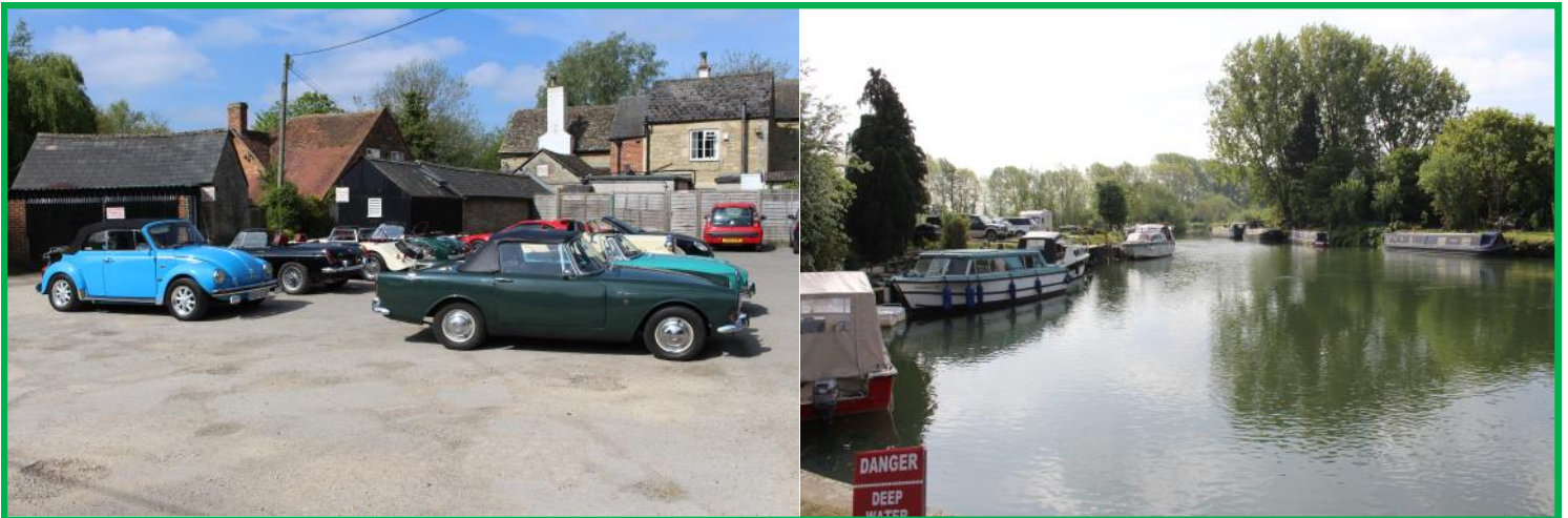
Two sides of the Trout Inn at Lechlade