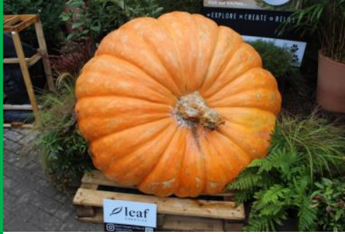
Too big for the pot