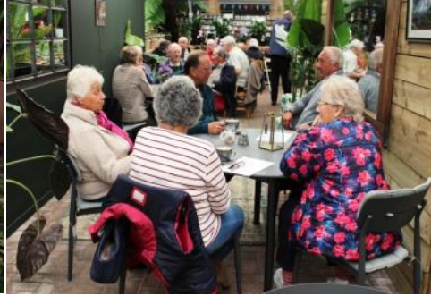
Plenty of coffee and chat