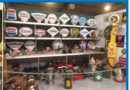
So much choice