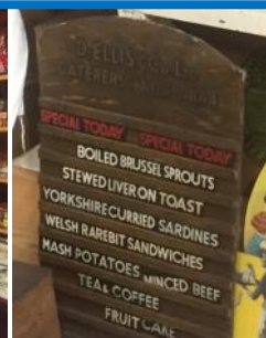
The Old Cuisine