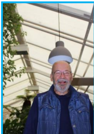
Spent too long in China ?

Well here we are in November already—where did it all go ? Considering the fact that Covid is still very widespread we seem to have done quite well with our events and there are still a few left before the year is over. A big thank you to all those members who have organised our Lunch Runs and visits through the year.