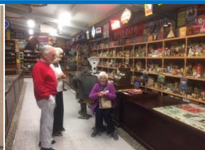
Ahh! When we were young